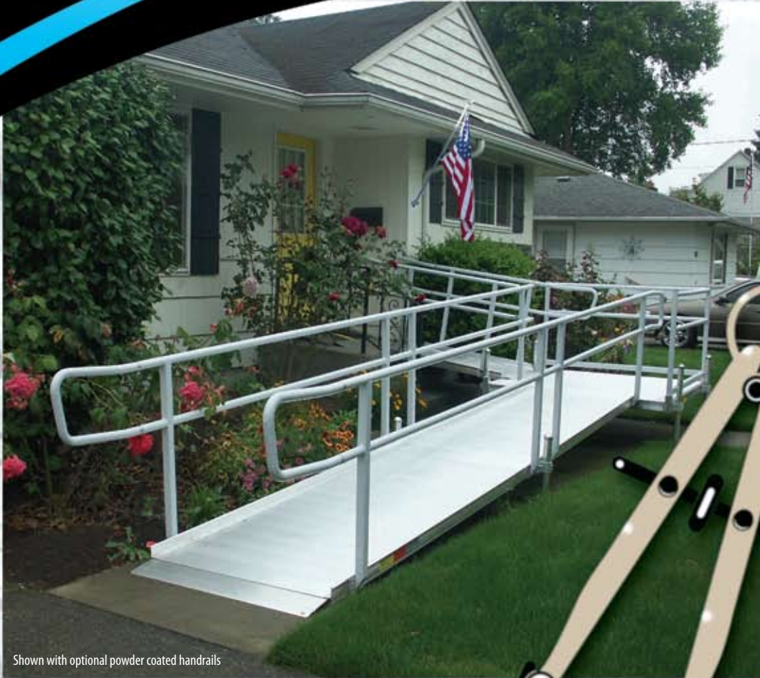
Shown with optional powder coated handrails